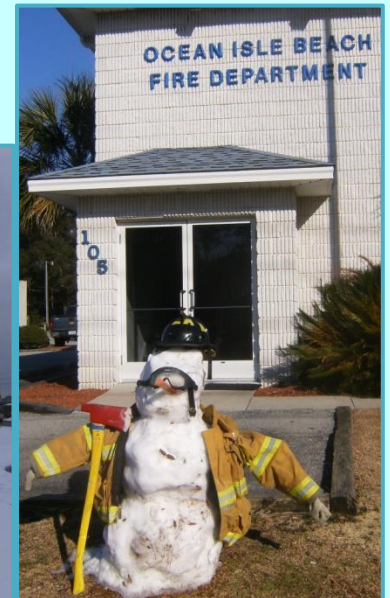
The OIB firefighters had fun in the snow.

The holiday trivia went over so well in our Winter 2009 newsletter, we thought we'd give it another try. It's like the Spiderman 3 movie, or Superman 5 - If it worked the first time, just keep doing it. You'll find the answers on a later page.