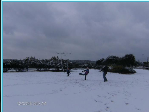
Snowball fight in OIB?