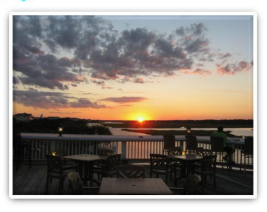
taken from the deck at Pogie's.

• Effective in April 2013, ATMC will be able to offer cable service to Ocean Isle homeowners. Until then homeowners have been limited to Time Warner Cable, unless they went with a satellite TV company.